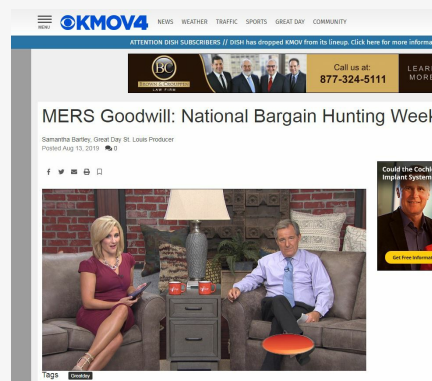
MERS Goodwill: National