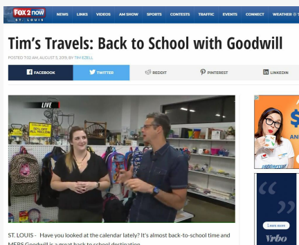
Tim's Travels: Back to