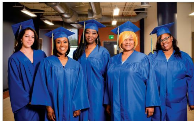
Five graduates of The Excel Center of MERS Goodwill in St. Louis stand together after their graduation ceremony in May.

The Excel Center of MERS Goodwill in St. Louis gives adults free education towards a high school diploma